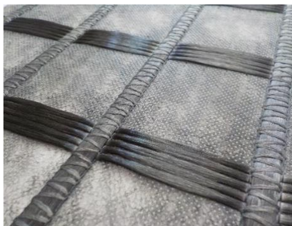
Figure 1. The Notex® Glass geosynthetics are obtained by warp-knitting a light geotextile and a glass-fiber geogrid. An additional coating can also be added when needed (here, with bituminous coating).

Another refinement is yet performed on the Notex® Glass C range. It corresponds to the same design as Notex® Glass but with an additional coating in order to maximize product adhesion to asphalt mixtures (Figure 1 - Table 1). This latter design will be identified as GG/veil C to illustrate that it combines a fiberglass geogrid with a light veil, and a coating.