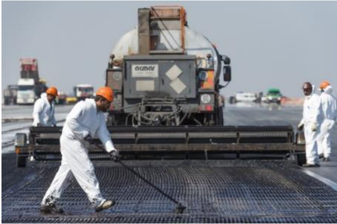
Figure 2. Laying of a reinforcement geosynthetics on runway 2 of Paris CDG airport in 2016.

Laying in the fresh emulsion is also of critical importance, given that the high viscosity of the binder used in the tack coat makes it unlikely that it will rise by capillarity in the product once the emulsion has broken, contrary to the low viscosity fresh tack coat emulsion. The use of light brooms to force the emulsion to penetrate the geosynthetics greatly improves the phenomenon and must therefore always been performed swiftly after laying, given that the emulsion can break in less than 15 min during hot summer days. An example of perfect installation was performed on Paris Charles de Gaulle (CDG) Airport (Figure 2).